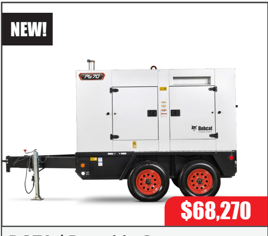
PG70 | Portable Generator 70 KVA (56 KW) OUTPUT, 37-HOUR RUNTIME AT 100% LOAD