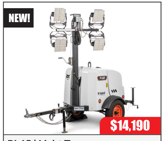
PL65 | Light Tower 119-HOUR RUNTIME, 50,000-HOUR LED LAMPS, 23FT. 360° ROTATING MAST