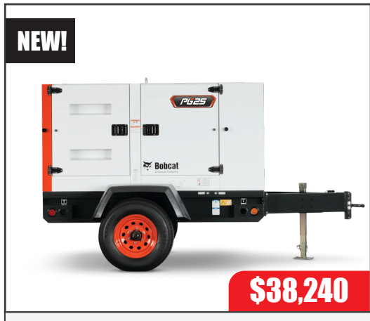
PG25 | Portable Generator 25 KVA (20 KW) OUTPUT, 25-HOUR RUNTIME AT 100% LOAD