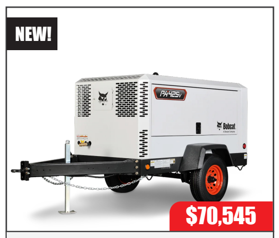
PA425V | Air Compressor 375 TO 425 CFM AIRFLOW AT 100 TO 150 PSI PRESSURE, CUMMINS® TIER 4 ENGINE